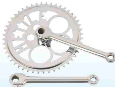
C-508 METTLE CUT Heavy Duty 44T / 46T / 48T CP