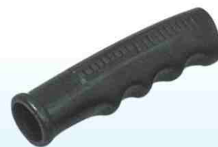
HANDLE GRIP Finger Type PVC