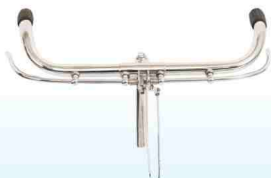
S-101 HIND TYPE 22" with Finger / Lumala / City Reflector / Dome Grip CP