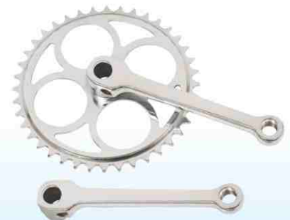
C-509 GOLA / TURBO CUT 40T CP