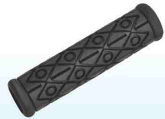
HANDLE GRIP Eye Model