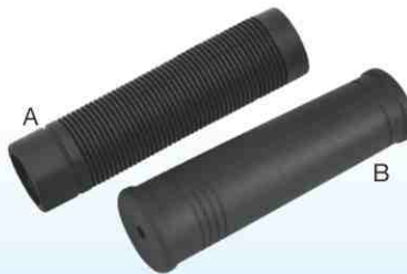
HANDLE GRIP A : Round Soft B : Conical