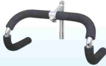
F-204 RACER CP/BPC