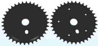
C-527 CHAINWHEEL DISC with Round Center Hole 26T / 28T / 32T / 36T BPC/CP