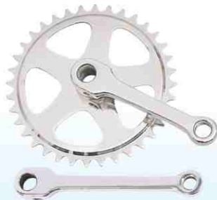
C-504 STAR CUT Cottered / Cotterless Type Crank 28T / 32T / 36T / 40T CP