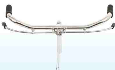
S-106 : NNR TYPE PH/T S-107 : NNR TYPE R/T with Finger / Lumala / City Reflector / Dome Grip CP