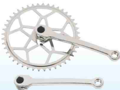
C-507 UTILITY CUT 44T / 46T / 48T CP