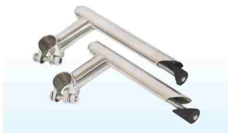
MTB Type Stem CP