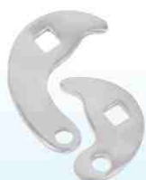
Handle Lever RL/Type Front / Back