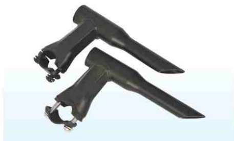
Brut Type with Hex Extension Reducing Stem with Bottom Bolts