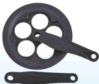
C-525 TURBO CUT with Lite Jumbo Crank 40T / 44T BPC