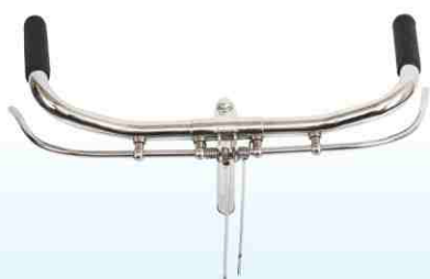
S-104 : HIND TYPE 20" S-105 : AT/TYPE 20" with Finger / Lumala / City Reflector / Dome Grip CP