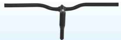
F-211 HANDLE BRUT PLUS Reducing Pipe Handle BPC-Matt