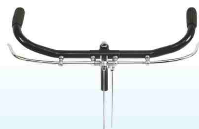
S-108 QUEEN NNR PH/T Semi BPC & CP with Dome Grip