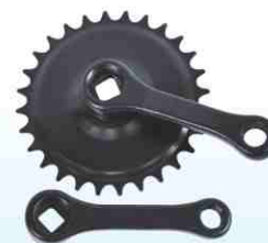
C-524 COMPACT DISC 28T / 32T / 36T Cotterless BPC