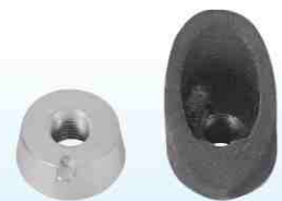
Handle Central Nut Taper Nut / Round Nut