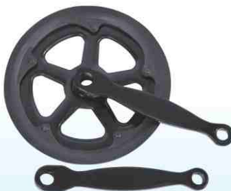
C-523 STAR CUT with Fish Crank 40T / 44T BPC