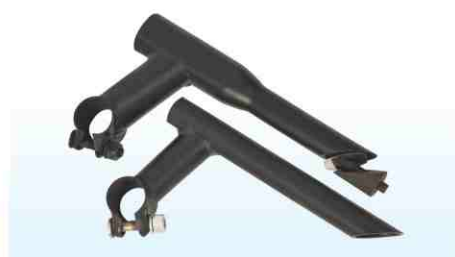
Fighter Type Reducing Stem BPC