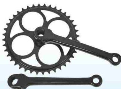
C-516 GOLA / TURBO CUT 40T BPC