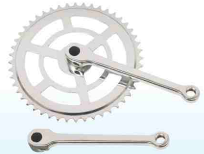
C-503 PHOENIX CUT 44T / 46T / 48T CP