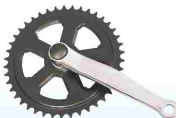
C-526 STAR CUT with Fish Crank 40T / 44T Cotterless BPC