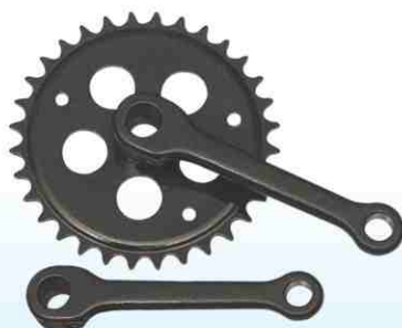
C-513 OLYMPIC CUT 28T / 32T / 36T / 40T BPC