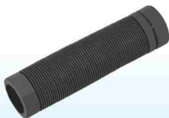
HANDLE GRIP Ranger