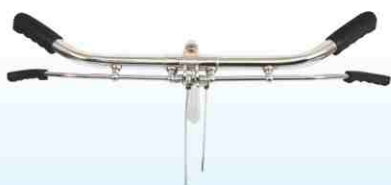
S-109 BALLOON / KINGA TYPE with Brake Lever Sleeve CP