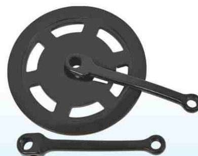
C-518 JAPAN CUT with Guard 40T / 44T / 46T BPC