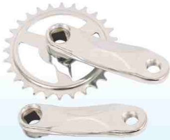
C-501 JAPAN CUT 28T / 32T / 36T CP Cotterless