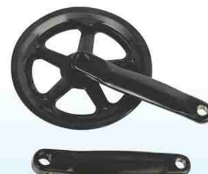
C-521 STAR CUT with Jumbo Crank 40T / 44T BPC X-Factor