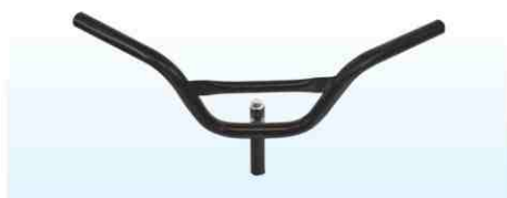
F-213 BMX KIDS BPC