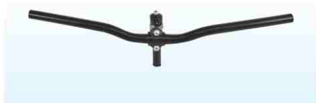
F-212 CZX/VYRUS Reducing Pipe Handle BPC