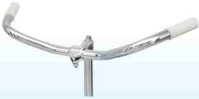
F-203 FRENCH CP+ Adjustable Stem CP