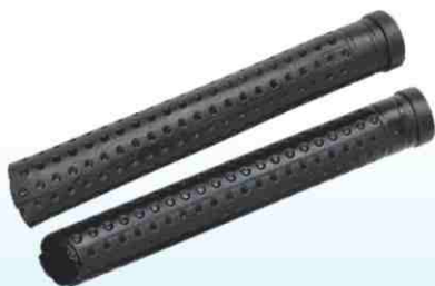
Handle End Bar Sleeve Only