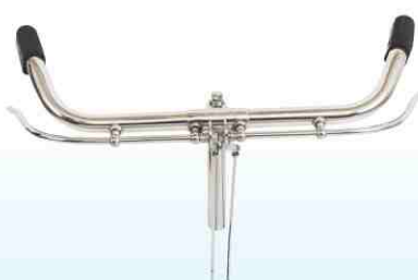
S-102 AT/TYPE 22" with Finger / Lumala / City Reflector / Dome Grip CP