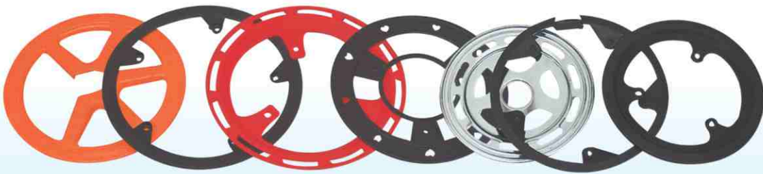
C-530 Chainwheel PVC Guards Colour to Order