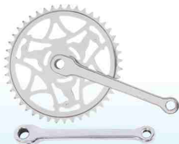
C-510 BIRD CUT 44T / 46T / 48T CP