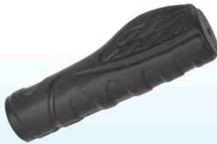
HANDLE GRIP Palm Model