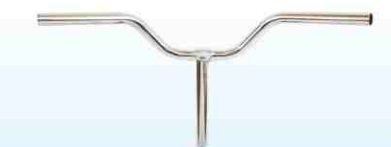
F-202 SLR - BPC