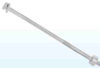
Handle Central Bolt with Round Nut