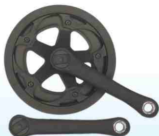
C-519 STAR CUT with PVC Crank 40T / 44T BPC