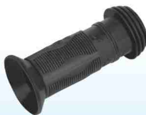
HANDLE GRIP Kid Black