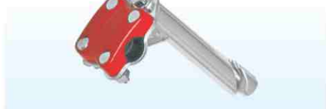
BMX Type with Forged Cone Stem Multi-Colour