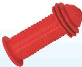
HANDLE GRIP Kid Multi-Colour