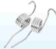
Handle Spring New Type Right/Left