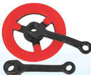
C-520 JAPAN CUT with Guard 28T / 32T / 36T BPC