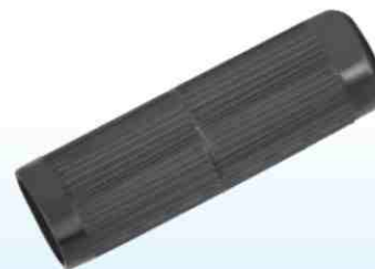
HANDLE GRIP Hero Type