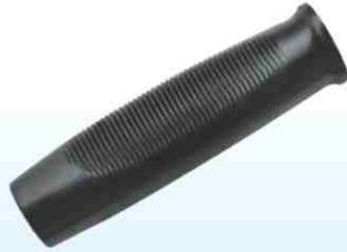
HANDLE GRIP MTB