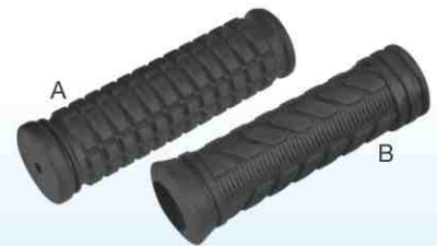
HANDLE GRIP A : MTB Ranger Square B : MTB Diamond