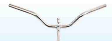
F-201 LADY BIRD CP