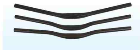
F-214 CALIBER / VOLTAGE 620mm/660mm/680mm BPC Reducing Pipe Handle