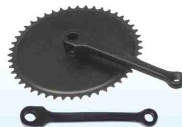
C-512 COMPACT DISC 44T / 46T / 48T BPC/CP