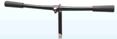
F-205 MTB FLAT with Stem BPC