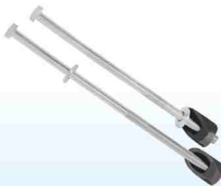
Handle Central Bolt with Taper Nut