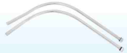
Handle Hathi / Brake Lever 20"/" 22" Right / Left