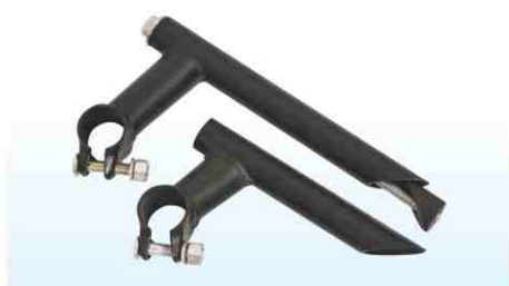
MTB Type Stem BPC