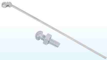
Handle Wire PH/T