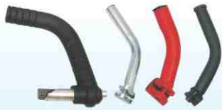
Multi-Models Bar Ends with Allen Key Bolts