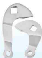
Handle Lever H/Type Front / Back