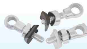
Handle Eye Bolts with D-Washer+D-Nut