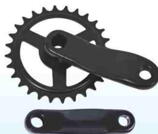
C-511 JAPAN CUT with Jamb Crank 28T / 32T / 36T BPC