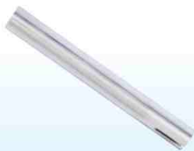
Standard Handle Bar Pipe Only