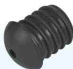
Handle End Cap