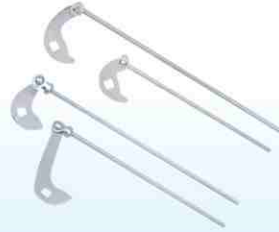
Handle Plunger Rod Lever with Wire