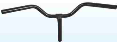
F-209 SLR - BPC