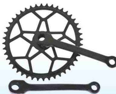
C-517 UTILITY CUT 44T / 46T / 48T BPC