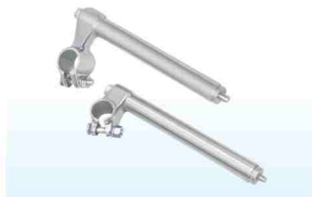
SLR / French Stem Model CP/BPC