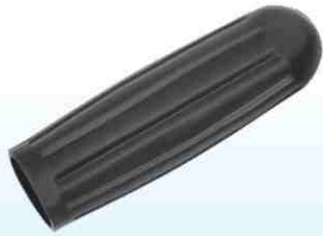
HANDLE GRIP Dome Type