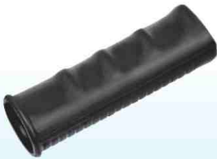
HANDLE GRIP Finger Type