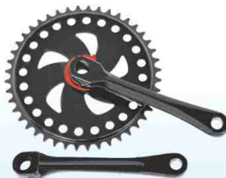
C-514 TURBO CUT Drive 40T / 44T BPC