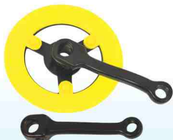
C-522 STAR CUT with Guard 28T / 32T / 36T BPC