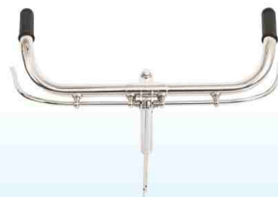
S-103 R/TYPE with Finger / Lumala / City Reflector / Dome Grip CP