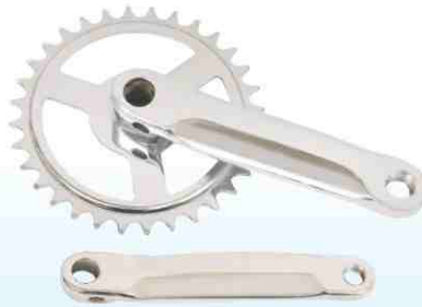
C-502 JAPAN CUT with Jumbo Crank 28T / 32T / 36T CP