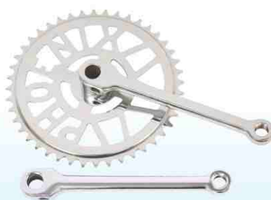
C-505 PHOENIX CUT 44T / 46T / 48T CP