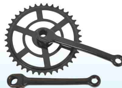
C-515 JAPAN CUT 44T / 46T / 48T BPC