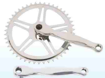
C-506 ITALY CUT Fish Type Crank 44T / 46T / 48T CP