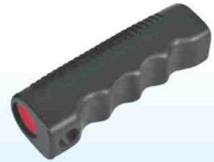
HANDLE GRIP Impact Reflector Type Lumala / Without Reflector Type